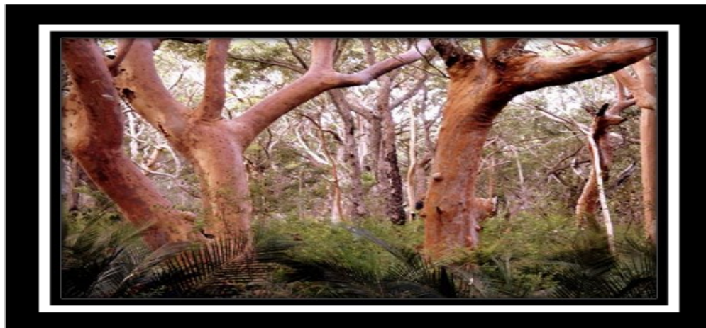
Angaphora tree in Semco Close, Black Rock